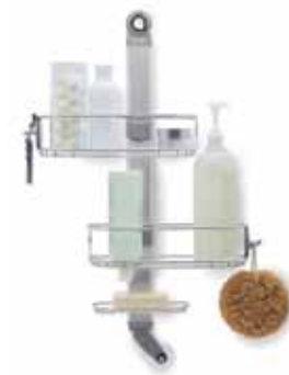
adjustable shower caddy