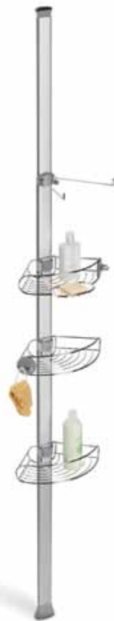
tension shower caddy

see the entire collection at www.simplehuman.com