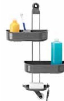
plastic adjustable shower caddy