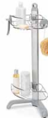
corner shower caddy