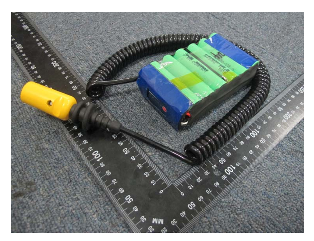
Fig.3 Internal view of battery