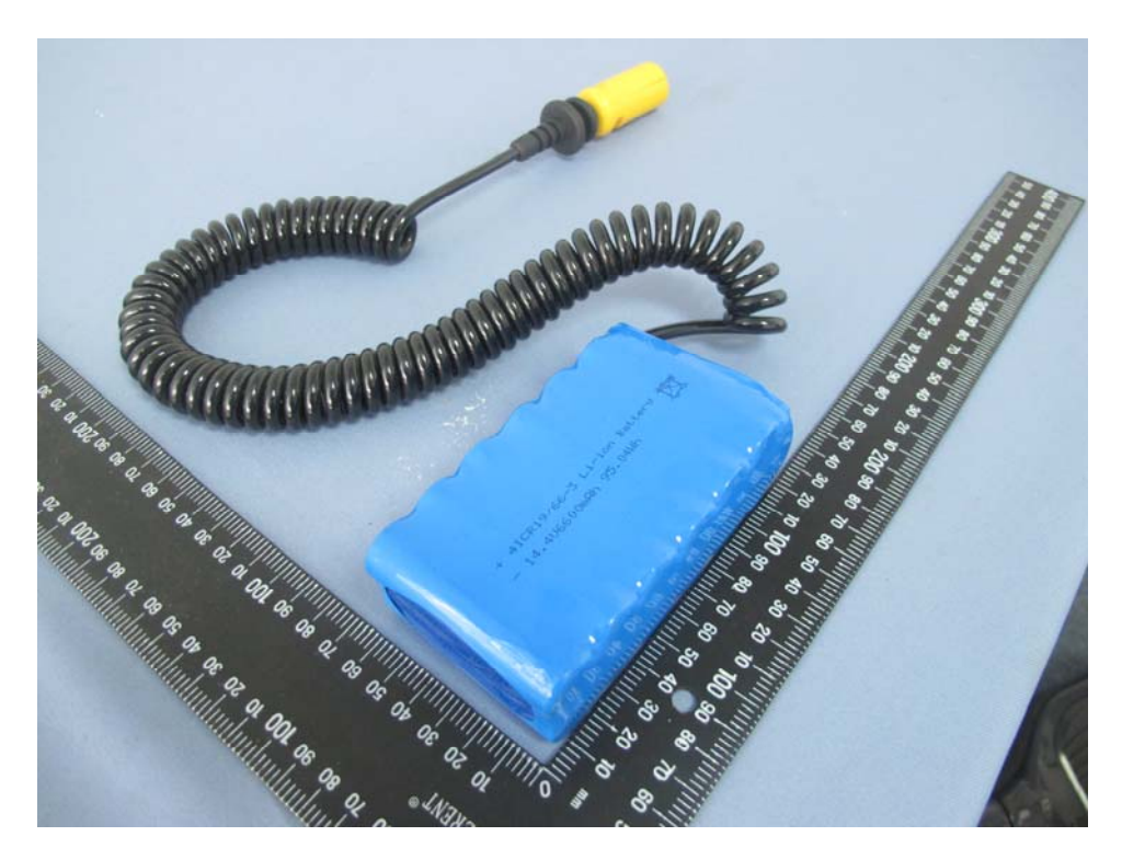
Fig.1 General view 1 of battery