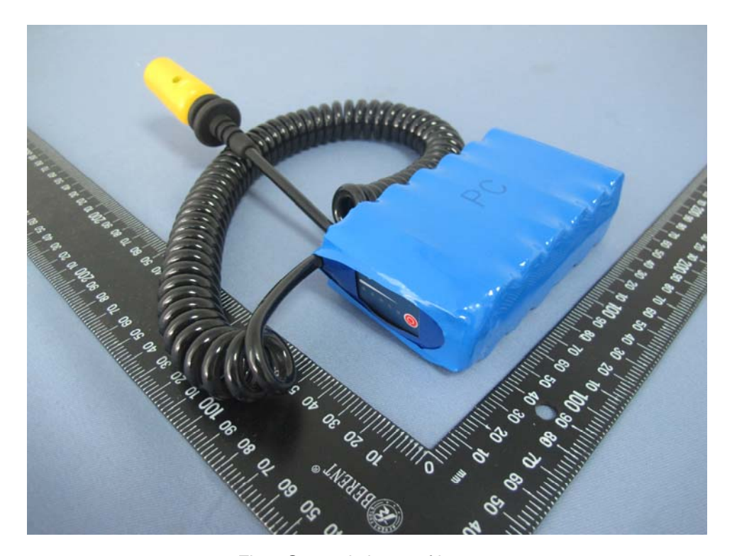
Fig.2 General view 2 of battery