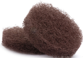
Abrasive pads brown

For serious scrubbing and polish removal