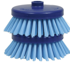
Brushes lightblue 0.3

Softer brushes for wooden floors or where the harder brushes might scratch. Good also for your boatdeck.