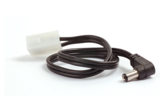
Pump motor cable

Complete with connectors for easy connection.