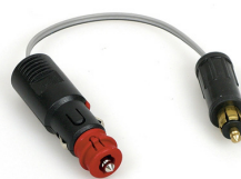
In-car charger 120mm

A convenient case to carry your complete Caddy Clean together with your accessories. Let you keep your equipment organized at the same toime as you carry it handy from place to place.