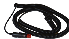
Cable for car battery 1500mm

Will fit to a standard lighter plug in a car, boat or on a scrubbing machine. Pay attention that this is only for temporarily charging in the field as the battery normally should be charged by a smart-charger. Leaving the battery in this charger for a long time may destroy the battery.