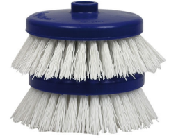
Brushes white 0.4

Soft brushes for textile and carpet cleaning.