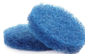
Abrasive pads blue

For general cleaning of treated floors, walls and half-gloss polishing.