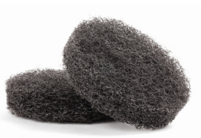
Abrasive pads black

For serious scrubbing and polish removal