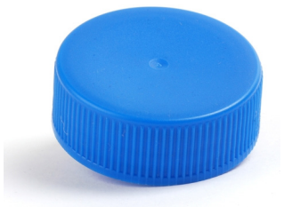
Cap for the tank

Holder for the tank. Mount on the shaft. Fits both the 1,7 l tank and the 2,4 l tank.