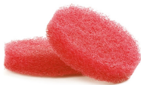
Abrasive pads red

For polishing and general dry and spraycleaning.