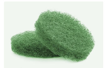
Abrasive pads green

För allmän sprayrengöring och underhåll av obehandlade golv och väggar.