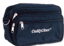
Shoulder/Waist carry case

Smart case to wear around your waist or over your shoulder. Suitable to carry your accessories like extra brushes, pads or a second battery.