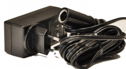
AC - adapter

A spiral cable with connector for car or boat. Extendable up to 7 m. So you can run your Caddy Clean direct from a 12 VDC car battery. (Cigarette lighter connector)