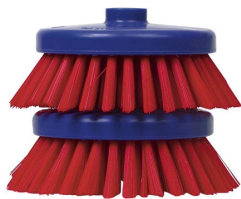
Brushes red 0.4

Colour code your brushes for different areas of cleaning.