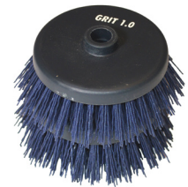
Brushes Grit 1.0

Standard brushes but harder, for more heavy duty cleaning.