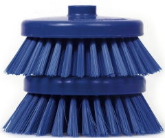
Brushes blue 0.4

Colour code your brushes for different areas of cleaning.