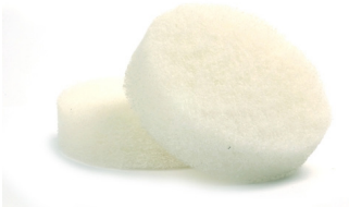
Non-Abrasive pads white

For polishing and general dry and spraycleaning.