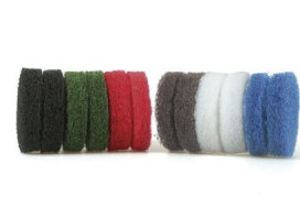
Abrasive pads mixed colours

Mixed pads for different use. Please see the different colours to understand what areas they are to be used in.