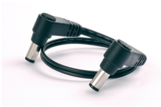
Cable (joint to motorunit)