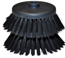
Brushes Black 0.25

Softer brushes for wooden floors or where the harder brushes might scratch. Good also for your boatdeck.