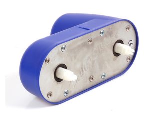
Gearbox and motor complete

Includes motor, gearbox and cover (blue)